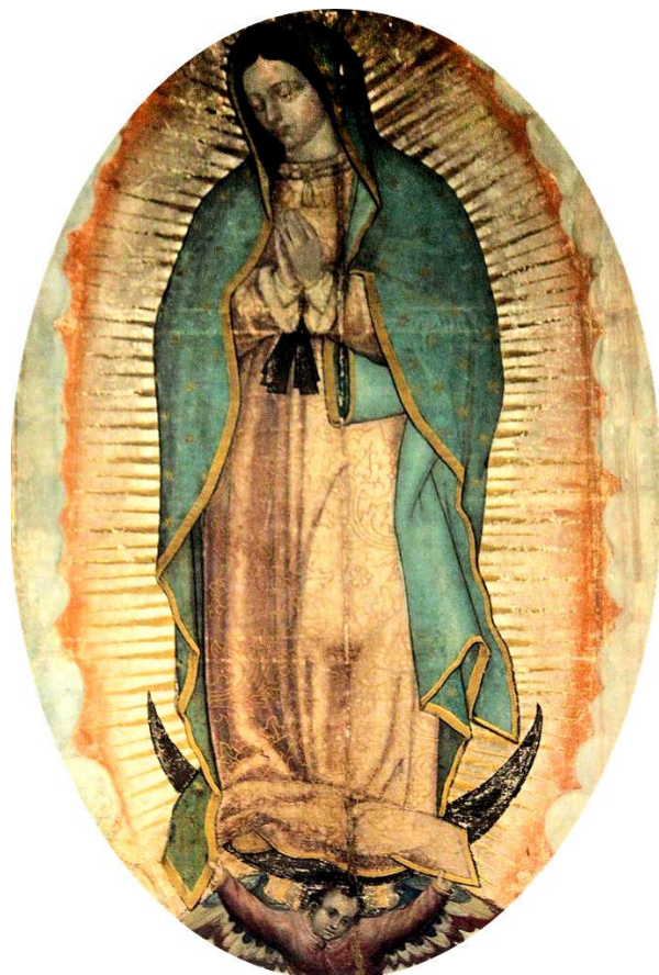
Our Lady of Guadalupe. This is the famous image that appeared on Juan Diego's tilma.