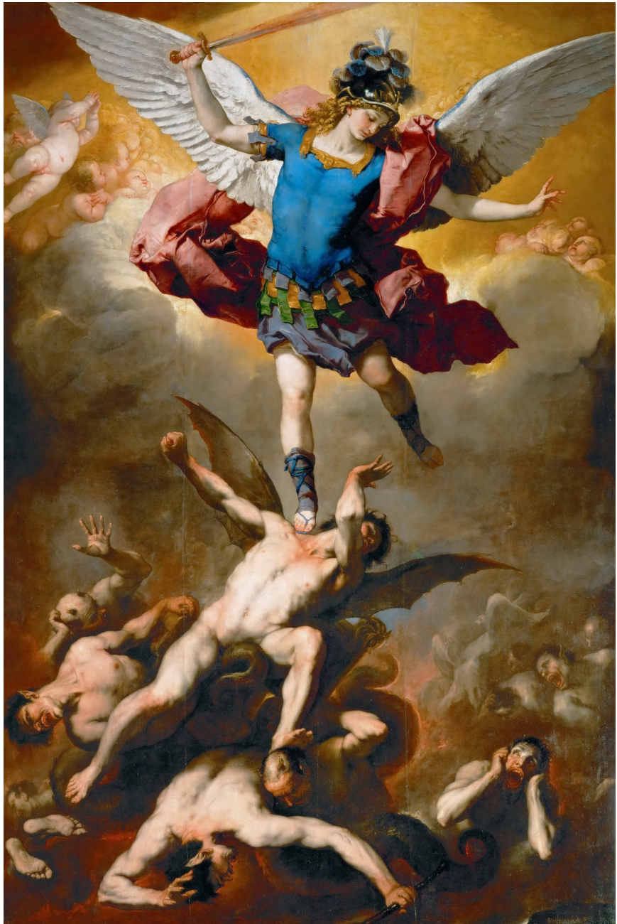
Archangel Michael Hurls the Rebellious Angels into the Abyss Luca Giordano, circa 1666