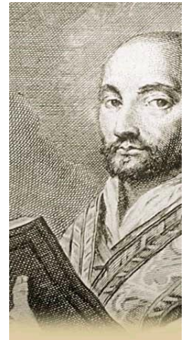
St. Ignatius of Loyola