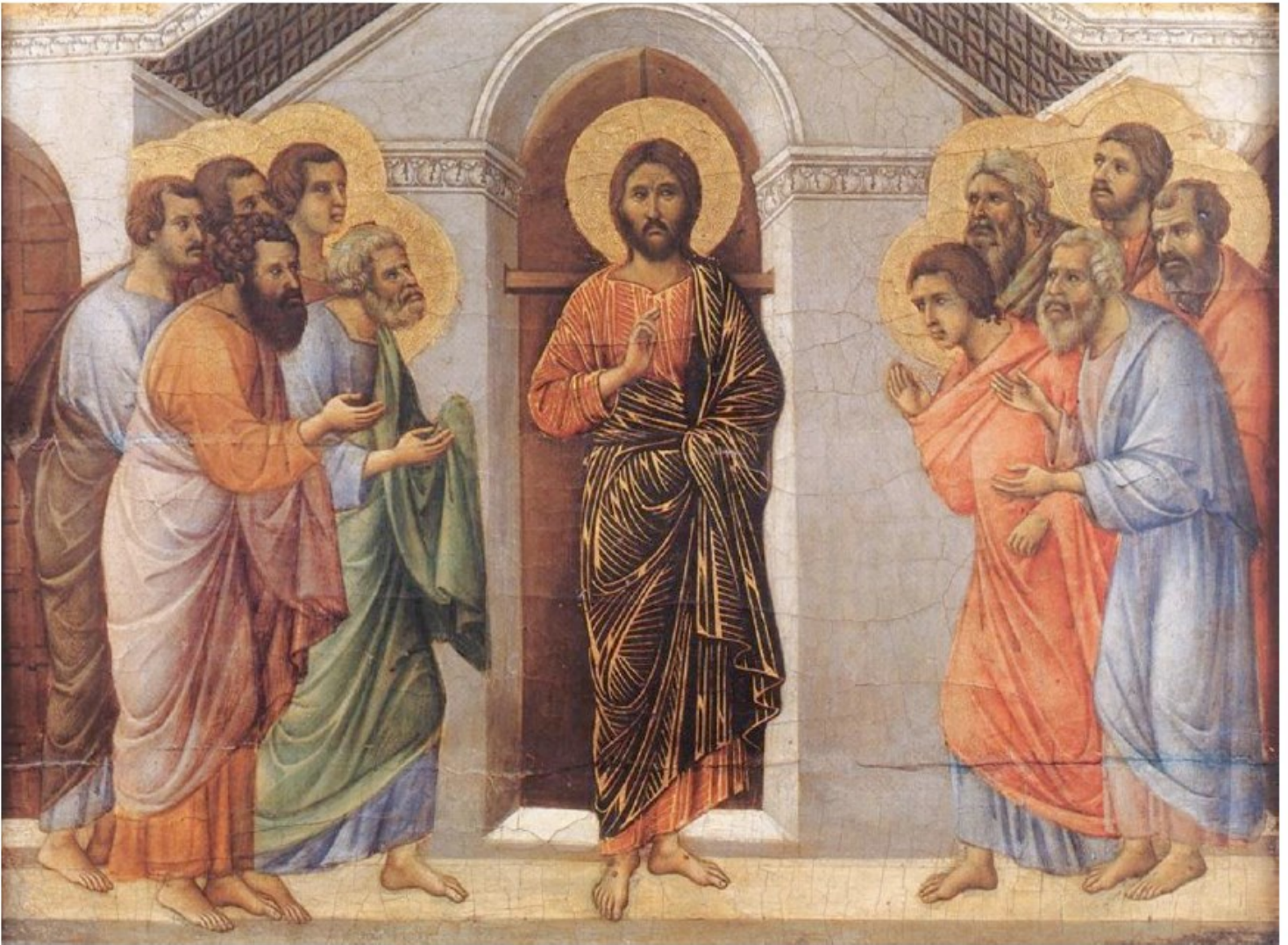
The Risen Christ Appears to the Apostles Behind Locked Doors, Duccio di Buoninsegna

Twelfth Sunday in Ordinary Time – June 25, 2017