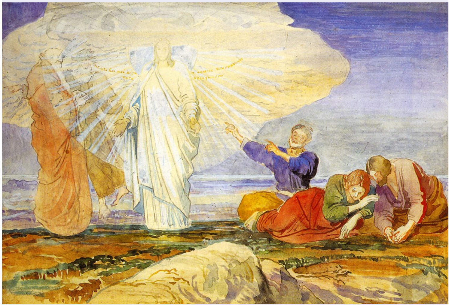
The Transfiguration of Christ, Alexandr Ivanov