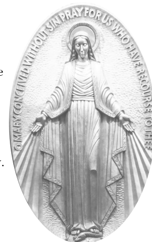
The Miraculous Medal

Why do we have these holy days of obligation? Three reasons: 1. to recall the mystery, 2. to thank God for the mystery, and 3. so that it will bear fruit in our lives. The fruit of this solemnity is that we grow in Faith by believing that God created Mary full of Grace so that she would be a most fitting mother of the Divine Son. Another fruit is an increase of charity. As we consider and celebrate what God has done for us, we experience His love for us, and we love Him in return. Hope is another fruit bearing virtue since we grow in conviction that Mary intercedes for us and that Our Lord purifies us so that we may enjoy eternal life with Him in Heaven.