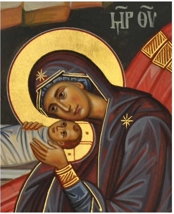
Nativity Icon.

Give them the faithful support of husband, family