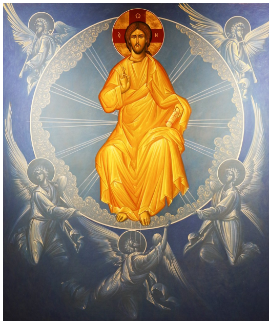
Ascension of the Lord. Icon, Notre Dame Institute, Jerusalem.

Confessions will be heard according to the normal daily schedule.