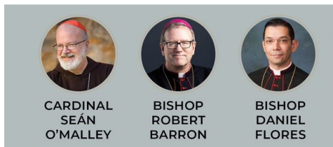
CARDINAL SEÁN O'MALLEY

SATURDAY, JUNE 18, 2022 8:30 A.M. TO 6:00 P.M. TSONGAS CENTER AT UMASS LOWELL