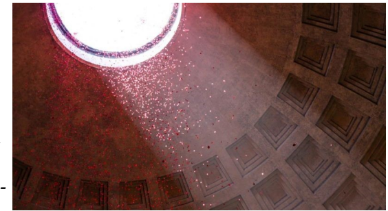
Rose petals fall from the Pantheon in Rome. Liturgical Arts Journal, Shawn Tribe, 2019.

In Italy the tradition on Pentecost Sunday is for rose petals to be dropped from the ceiling of the churches in imitation of the tongues of fire that fell upon the Church at Pentecost. The day is traditionally called Pascha Rosatum , or Paschal Rose Sunday.