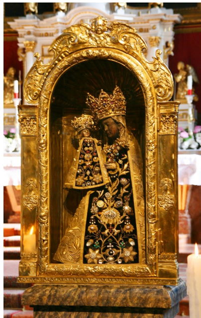
Our Lady of Altotting. Statue at the Shrine, Altotting, Germany.

Our Lady of Altotting is a statue found within the Chapel of Grace, the oldest sanctuary in Bavaria and originating in 660 AD. The current statue was carved and placed in the chapel around 1330. It was in 1489 that the Black Madonna image gained significant attention from pilgrims. In that year a young boy drowned in a nearby lake. His mother brought the boy before the feet of the statue of Our Lady, and the boy was revived. Since then, Our Lady of Altotting Shrine has become the most popular pilgrim site in Bavaria.