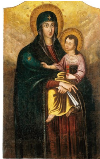
Our Lady of Siluva. Icon. Public Do-

An image of Our Lady of the Way was brought from Rome to Siluva, Lithuania in 1457. The image proved to be remarkably popular and the feast of Our Lady's Nativity was celebrated in the town with great excitement. Increasingly the area became more Calvinist than Catholic and many Catholic churches and properties were seized or burned. To prevent the loss of the great Marian image the one remaining priest of the area buried the image in a box underground on the property of the Catholic church. In 1608 some children of Siluva maintained that they saw a beautiful lady holding a child and weeping on the site of the old Church. Catholics took that as a sign that Our Lady wanted her church back. They presented a case in court to retrieve the seized property and finally won their case in 1622. The box containing the original image was unearthed, and a new church was built in Our Lady's honor on the site and is today the Basilica of the Nativity of Mary.