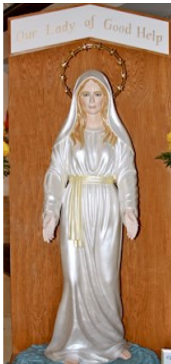
Our Lady of Good Help. Statue at the Shrine, Champion, Wisconsin.