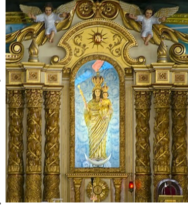
Our Lady of Vailankanni. Velankanni Church, Uttan.

Sometime in the 1550's a young boy in the fishing village of Vailankanni on the east coast of India was making his daily route to bring milk to a rich gentleman 6 miles away. The boy fell asleep on the way and woke to see a beautiful lady holding a baby. She asked the boy for some milk for the child and he reverently agreed. When he arrived late at the rich man's house he asked for pardon for the lack of milk due to the need of the child. When they opened the pot milk flowed out and did not stop. Several years later Our Lady appeared again to a crippled boy selling buttermilk in the area. She again asked for some milk for her baby and the boy agreed. She then told him to go to the next village and tell a certain gentleman that she wanted a church built in her honor there. The boy told Our Lady that he was unable to go as he was crippled. She told him to rise up and he was able to stand and walk. The church is named for Our Lady of Good Health.