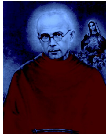
St. Maximilian Kolbe with Our Lady.

St. Maximilian Kolbe spent much of his life promoting the cause of consecration to Our Lady as the surest means to holiness and to imitation of Christ. A bit of a rambunctious child, 12-year old Raymond (his given baptismal name) had driven his loving mother to a bit of frustration and anxiety as to what would become of her son. That night Raymond prayed to Our Lady asking for her help. She appeared to Raymond and offered him to choose as his future between two crowns, a white crown for lifelong heroic purity, or a red crown for martyrdom. Little Raymond chose both crowns. From that day he set about becoming a Franciscan Friar, a scholar, a missionary, a saint and martyr of charity at the consecration camp in Auschwitz.