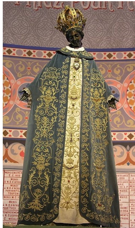
Our Lady of Africa. Statue, Basilica of Our Lady

Mary, Our Mother of Africa, hear the drumbeat of our prayers. May Your Son Jesus continue to bring us joy, receive our anxieties, and forgive us our sins. Help us to walk in His light. Help us to help others do the same. And bring us to life everlasting with the Holy Saints and Angels. Amen.