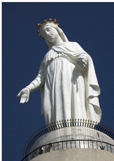
Our Lady of Harissa. Statue at the Shrine of Our Lady, Harissa, Lebanon.

Dear Mother, increase our love, the love we should have for the Blessed Trinity: Father, Son, and Holy Spirit; our filial love for you, and perfect it in love for our neighbor. Our Lady, Queen of Lebanon. Pray for us.