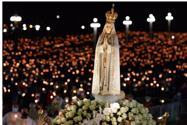
Our Lady of Fatima. Shrine of Our Lady of Fatima, Portugal.

and reveal a glorious message. We implore you, inspire in our hearts a fervent love for the recitation of the Rosary. By meditating on the mysteries of the redemption that are recalled therein may we obtain the graces and virtues that we ask, through the merits of Jesus Christ, our Lord and Redeemer. Amen.