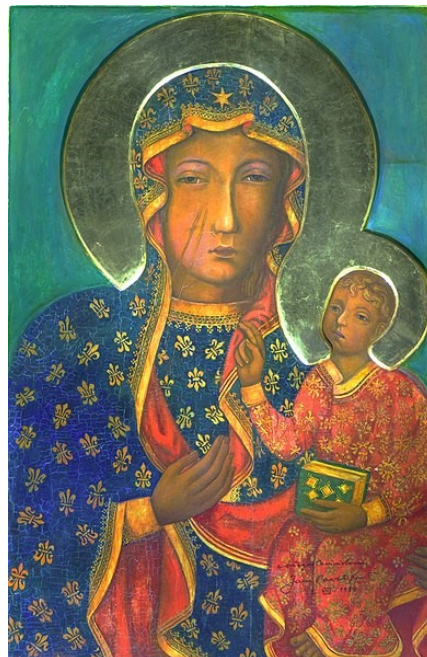
Our Lady of Czestochowa. Icon from Shrine of Our Lady of Czestochowa, Doylestown, PA.

Holy Mother of Czestochowa, Thou art full of grace, goodness and mercy. I consecrate to Thee all my thoughts, words and actions, my soul and body. I beseech Thy blessings and especially prayers for my salvation. Today, I consecrate myself to Thee, Good Mother, totally, with body and soul amid joy and sufferings to obtain for myself and others Thy blessings on this earth and eternal life in Heaven. Amen.