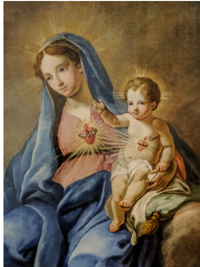
The Two Hearts. Detail from Painting at St. Francis Chapel—Boston

Pope Innocent XI added the feast of the Holy Name of Mary to the liturgical calendar to honor Our Lady for the victory of the Catholic armies of Europe over the Ottoman Turks at the Battle of Vienna in 1683. Vienna had come under siege for several months from an Ottoman army of 150,000 soldiers. The King of Poland, Jan Sobieski, rallied his cavalry forces in Krakow to come to the aid of Vienna. Before leaving for Vienna, Jan visited the Monastery of Jasna Gora and the image of Our Lady of Czestochowa to consecrate his army and his cause to her. Sobieski and his army left Krakow on August 15, the Solemnity of the Assumption, and arrived at Vienna on September 12. As the Ottoman force was ready to breach the defending wall of the city, Sobieski's cavalry arrived. In the largest cavalry charge in world history, 18,000 Polish-Lithuanian cavalymen under King Jan charged at the Ottoman forces and drove them from the field, thus saving Vienna and Christian Europe. September 12 is the Patronal Feast Day of the Oblates of the Virgin Mary.