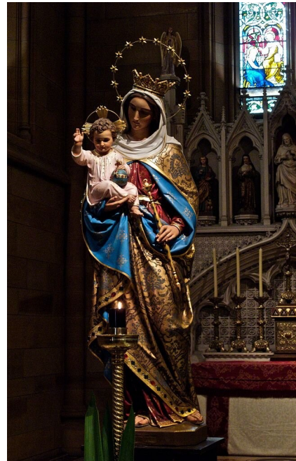
Our Lady Help of Christians. Statue at the Carmel of the Immaculate Conception,