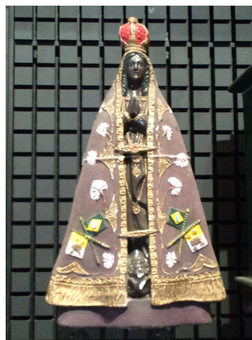
Our Lady of Aparecida.

Lady Aparecida, welcome under your protecting mantle men and women religious, families, children, young people, priests and bishops. Health of the sick and Consoler of the afflicted, comfort those who are suffering in body and soul; be the light of those who are seeking Christ, the Redeemer of all; show all people that you are the Mother of our confidence. Queen of Peace and Mirror of Justice, ensure that Brazil and all countries may have lasting peace, that we will always live together as brothers and sisters and as children of God. Our Lady Aparecida, bless all your sons and daughters who pray and sing to you here and elsewhere. Amen.