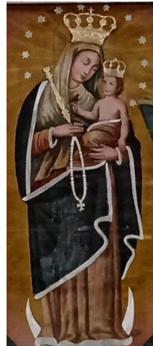
Our Lady of Chiquinquirá.

Our Lady of Chiquinquirá, you answer the desires of our hearts. Show me the way your Son wants for me. Make me see the brilliance and joy of answering to the call he makes so lovingly. Help me to look at my life with a little distance and objectivity, so that I can see the will of God for me clearly. Amen.