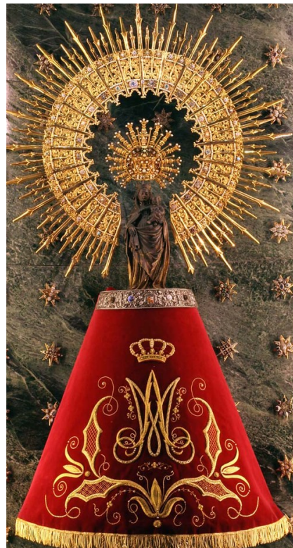
Our Lady of the Pillar. Statue at the Basilica, Zaragoza.

Most Holy Virgin of Pillar, to thy care we confide the needs of our families, the joys of children, the dreams of youth, the anxieties of adults, the sufferings of the sick, and our preparation for life's end. To Thee we entrust the perseverance of our priests and religious. Ever increase our Faith, give assurance to our Hope and enliven our Charity. Amen.