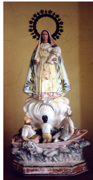
Our Lady of Charity. Shrine of of Our Lady, El Cobre, Cuba.

Mother of Charity! We place ourselves under your mantle of protection! Blessed are you among women and blessed is the fruit of your womb, Jesus! And to Him be the glory and the power now and forever. Amen.