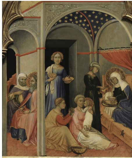
Birth of Our Blessed Lady. Andrea di Bartolo, National Gallery of Art, Washington DC.

O Virgin immaculate, thou wast conqueror of the infernal serpent from the first instant of thy existence; renew even now, for it is now more necessary than ever before, thine ancient triumphs; glorify thy divine Son, bring back to Him the sheep that have strayed from the one fold and place them once more under the guidance of the universal Shepherd who holds the place of thy Son on earth; let it be thy glory, O Virgin, who destroy all heresies, to restore unity and peace once more to all the Christian people. Amen.