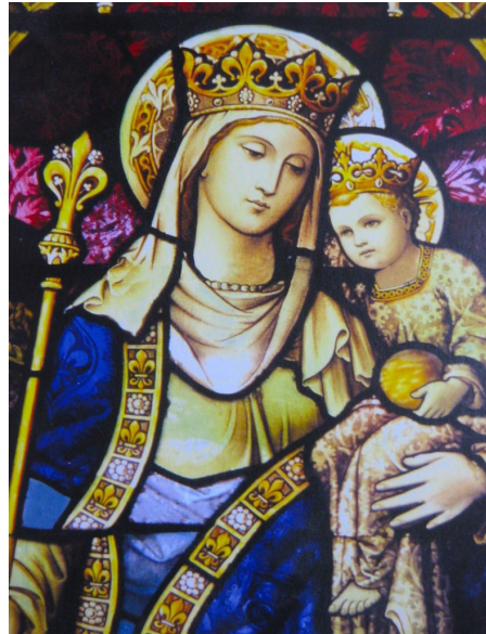
Queen of Heaven.

O Mary, when our eyes close in our last sleep, and open to behold thy Son, the Just Judge, and the Angel opens the Book, and the Enemy accuses us; in that terrible hour, come to our aid. Be with us. When death came to Joseph, you and your Son were with him: Thy Son to judge, thou to console. O Happy Joseph! When death comes for us, be near us. O Mary, Stretch forth thy hand to help us; deliver us from our bondage. We are thy children, you are our Mother. As little children we come to you; we know no fear. O Mary, He changed water into wine for thee, even as He said: My hour has not yet come. Now He will not refuse thee, when you plead for us thy children. O Mary, come quickly to our aid. Do not let us stray from the Fold. Amen.