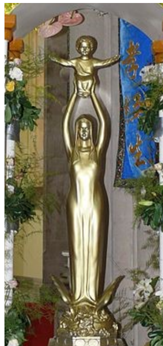
Our Lady of She-Shan. Statue at the Basilica of Mary Help of Christians.

In the statue overlooking the Shrine you lift your Son on high, offering him to the world with open arms in a gesture of love. Help Catholics always to be credible witnesses to this love, ever clinging to the rock of Peter on which the Church is built. Mother of China and all Asia, pray for us, now and for ever. Amen!