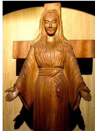
Our Lady of Akita.