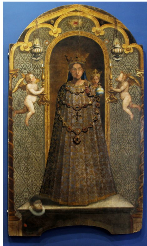
Our Lady of Loreto. San Lorenzo Maggiore, Naples.

“Blessed among all women,” who remind us of the incarnation of the word in your purest bosom, for your blessed house, where you lived with Jesus and Joseph, and which became during the centuries the fervently longed-for destination of the saints, who considered themselves lucky to kiss fervently your sacred walls, bestow upon us the graces which we humbly ask, and the fortune of coming to heaven after this exile, to repeat to you the greetings of the angel: Hail, Mary. Amen.