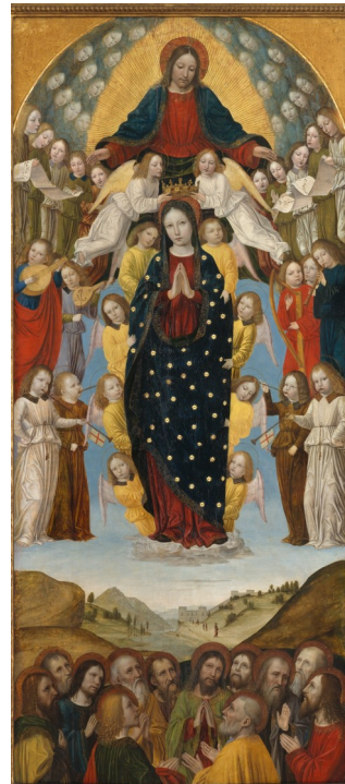
Assumption of the Virgin Mary. Ambrogio Berggnone. The Metro-

When my hour of death has come, lead me safely to the presence of Jesus to enjoy the vision of my God for all eternity together with you. Amen.