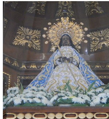
Our Lady of Good Voyage. Statue, Shrine of Our Lady of the Immaculate Conception. Antipolo, Philippines.

And at our journey's end, lead us to the doorsteps of heaven and bring us to your Son Jesus who has secured and prepared for us a place in our Father's home. Amen.