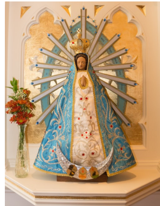
Our Lady of Lujan. Institute of the Incarnate Word.