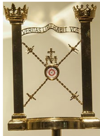
First Class of Relic of St. Maximilian Kolbe at St. Francis Chapel.

R. Give me strength against Your enemies.