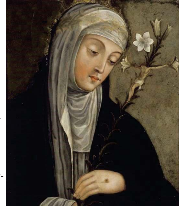
St. Catherine of Siena.

St. Catherine of Siena said: "Be who God meant you to be, and you will set the world on fire. The Lord Jesus declared: "I have come to set the earth on fire, and how I wish it were already blazing." He was preoccupied with the urgency of the blazing of the purifying fire of love. It is an irresistible fire that effects the necessary change that brings freedom to humanity. It was the fire that burned in the heart of the Prophet Jeremiah that he could not resist speaking the truth in the interest of the welfare of many in the time of King Zedekiah, With the threat of Nebuchadnezzar, king of Babylon. It is the fire that rouses the missionary courage a disciple needs, a fire that sustained the sacrifice of Calvary.