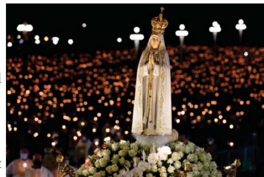
Our Lady of Fatima. Shrine of Our Lady of Fatima, Portugal.

O Most Holy Virgin Mary, Queen of the most holy Rosary, you were pleased to appear to the children of Fatima and reveal a glorious message. We implore you, inspire in our hearts a fervent love for the recitation of the Rosary. By meditating on the mysteries of the redemption that are recalled therein may we obtain the graces and virtues that we ask, through the merits of Jesus Christ, our Lord and Redeemer. Amen.