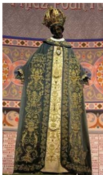
Our Lady of Africa. Statue, Basilica of Our Lady of Africa, Algiers.

Mary, Our Mother of Africa, hear the drumbeat of our prayers. May Your Son Jesus continue to bring us joy, receive our anxieties, and forgive us our sins. Help us to walk in His light. Help us to help others do the same. And bring us to life everlasting with the Holy Saints and Angels. Amen.