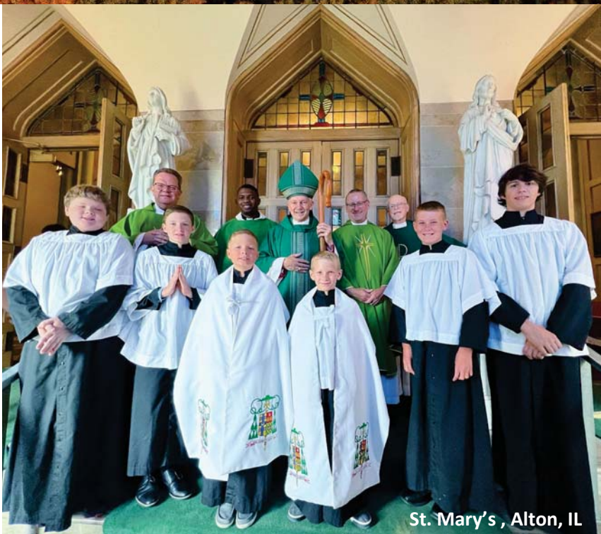
St. Mary's , Alton, IL