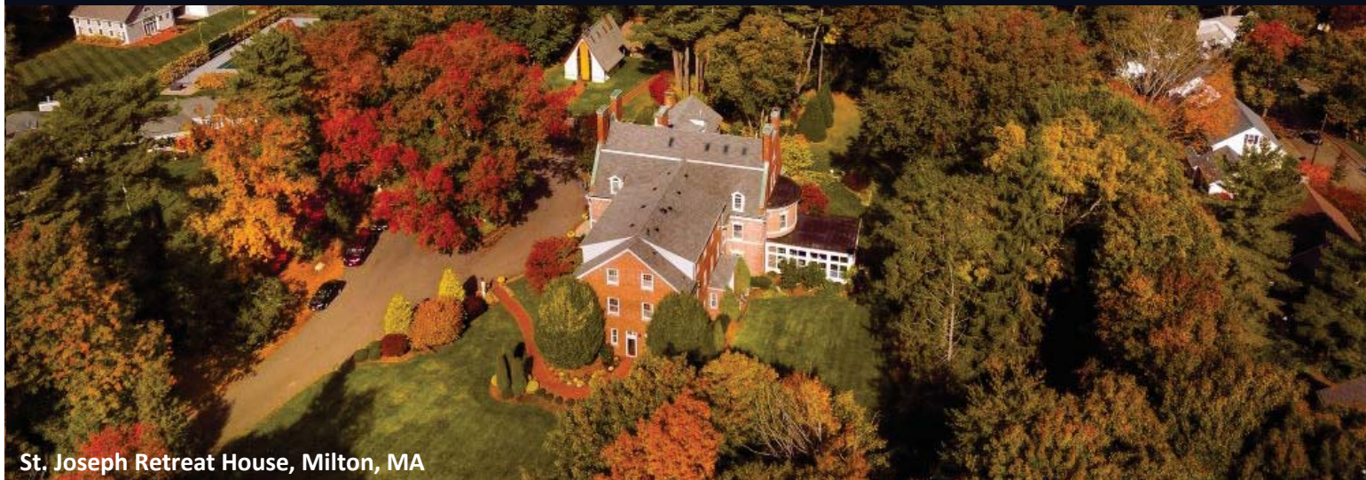
St. Joseph Retreat House, Milton, MA

Join the Oblates of the Virgin Mary in Boston for an evening of cocktails, dinner, an auction and fellowship to support OMV Seminarians!